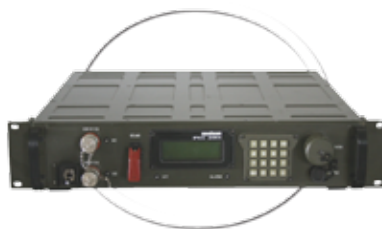
IP Crypto Device