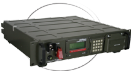
Key Distribution Terminal

Transmission Security is established through ASELSAN GRC-5220 Tactical IP Radio Link devices and ASELSAN Software Define Networking Radios. Both radio family feature state-of-the art electronic protection measures. GRC-5220 radios support full band (NATO Band III+/Band IV) adaptive fast frequency hopping, automatic power control, anti-spoofing, Forward Error Correction (FEC) and more. ASELSAN Software Define Networking Radios are equipped with several advanced networking waveforms with several TRANSEC features including frequency hopping/Direct Sequence Spread Spectrum, Anti-spoofing, FEC, and Automatic Adaptive Relaying.