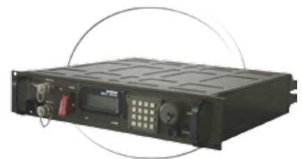
Link Encryption Device